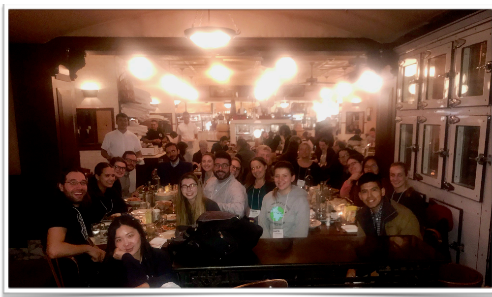
Photo: MAPOR Student/Early-Career Lunch 2018

5:30-7:00pm at Jolly Pumpkin. Stay tuned for opportunities to meet other students and early career researchers at the AAPOR conference in May, and for our 2019 call for papers! We look forward to meeting you and welcoming you as part of the MAPOR community.